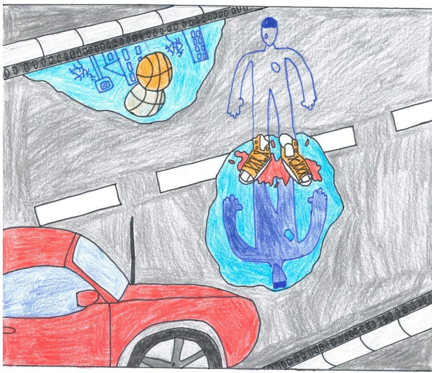
Winning entry of the Ghost Boys competition