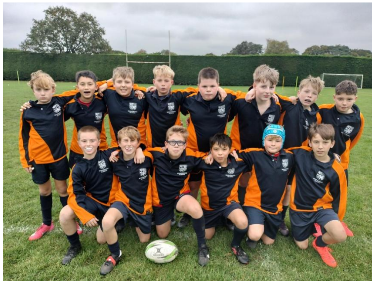
Year 7 Rugby Team

Outside of lessons, we see fantastic team work going on, especially in the Football and Rugby teams, which have seen great success already and I know the PE department have high hopes for more success in the future. We also know that many students excel in lots of different activities outside of school and we look forward to hearing of their achievements as the year goes on. Please do keep us posted.